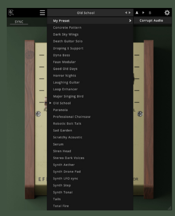
Sub-folders are also recognized to manage presets into groups, useful to manage additional preset bank, or grouping presets based by their use.